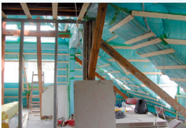
BlowerDoor test for quality assurance during construction

In addition to the automated BlowerDoor measurement, other new features of the TECTITE Express 4.1 measuring software include the possibility of conducting semi-automated or, if required, manual tests and including the calibration date of the pressure gauge and measuring fan in the BlowerDoor test log. 12 pressure stages can be selected for each measurement series. For unfavorable climatic conditions or specific building properties, the accuracy of the measurement can be increased further by entering up to 1,000 measuring points per pressure stage. Each measurement series also includes the interior and exterior temperature as well as the corresponding air pressure. The modular set-up allows you to add the WiFi function to the existing BlowerDoor measuring system with DG-700 at any time.