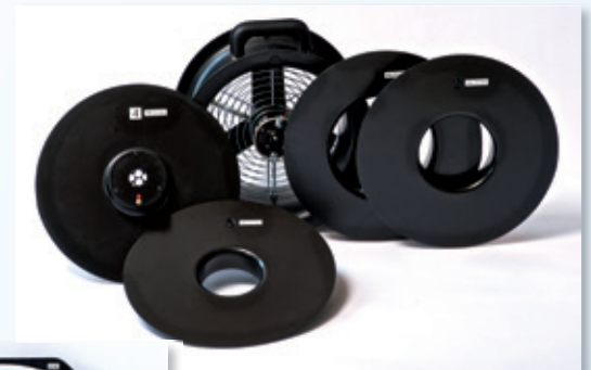
Above: DuctBlaster fan (Measurement System BlowerDoor MiniFan) with flow rings 1-4