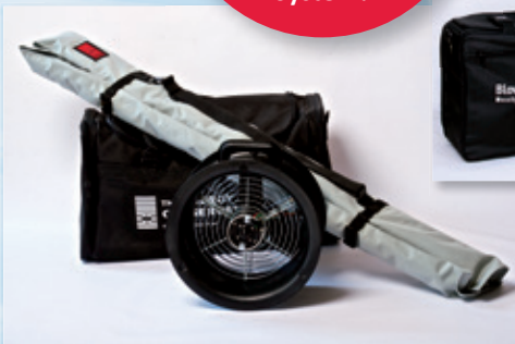
Left: Handy – Minneapolis BlowerDoor MiniFan