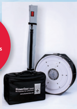
Above: Minneapolis BlowerDoor Standard

4-year warranty on the entire Minneapolis BlowerDoor Measurement System!