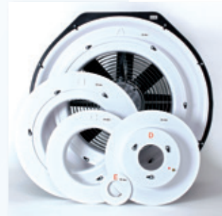
Left: BlowerDoor fan with flow rings A-E