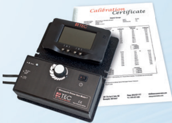
The digital pressure gauge DG-1000 inclusive high resolution Touch Screen, integrated WLAN module and software updates free of charge