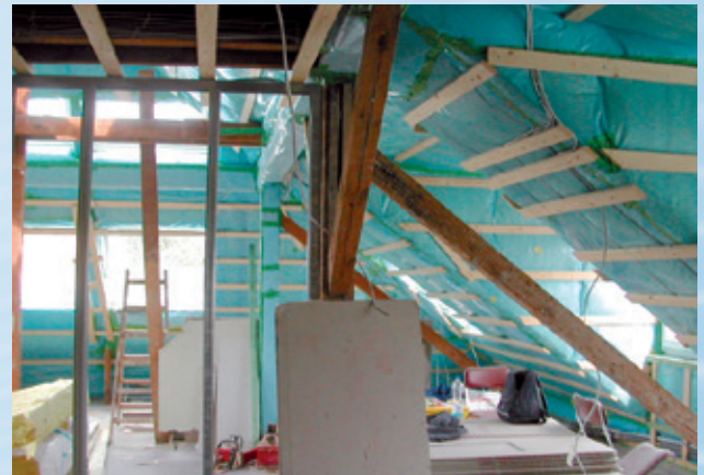
BlowerDoor test for quality assurance during construction

The calibration dates of the BlowerDoor measuring devices used are included in the test log, providing important information on the high accuracy of the measuring technology. The TECTITE Express 5.1 software allows you to select 12 pressure stages for each measurement series. For unfavorable climatic conditions or specific building properties, the accuracy of the measurement can be increased further by entering up to 1,000 measuring points per pressure stage. Each measurement series also includes the interior and exterior temperature as well as the corresponding air pressure.