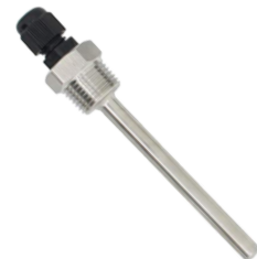
Thermowell Temp. Sensor

Loggerflex smart devices Ltd. 2- 3304, Cambie St. Vancouver, BC V5Z 2W5 Canada