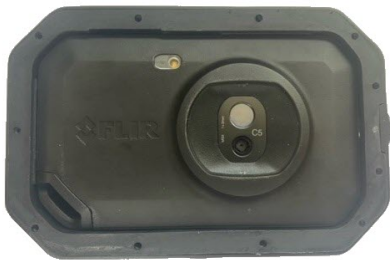
Figure 6.3 FLIR Cx5 case with FLIR C5 camera inserted.