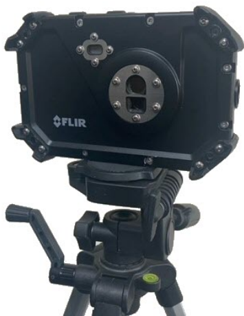
Figure 4.2 FLIR Cx5 attached to tripod.

The FLIR Cx5 case incorporates a centralised, bottom mounted tripod boss with a standard UNC \frac{1}{4} "-20.