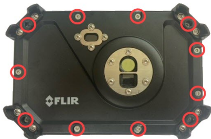
Figure 6.2 FLIR Cx5 main retaining bolts.