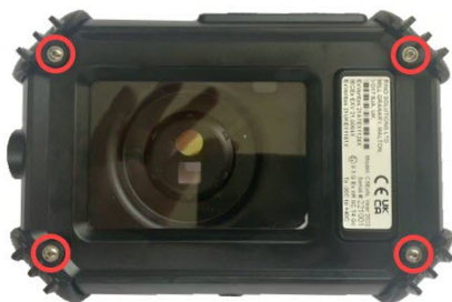
Figure 6.1 FLIR Cx5 shock absorber bolts.