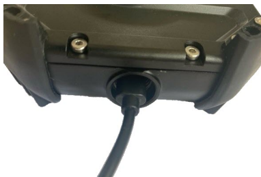
Figure 4.1 FLIR Cx5 with USB cable connected.