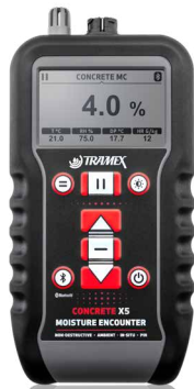
Product code: CMEX5

The probes can be used with the CMEX5, Feedback Datalogger RHTX, CMEX II or the MRH III for relative humidity testing in building structures and ambient conditions.