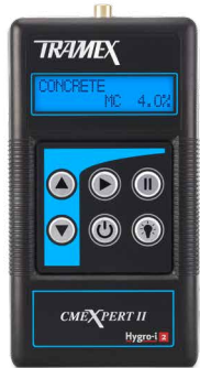
Product code: CMEX2 CMEXPERT II