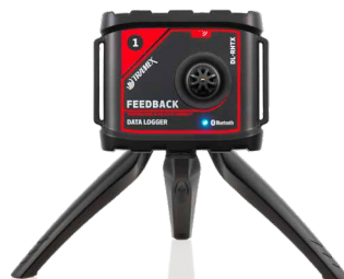
Product code: DL-RHTX