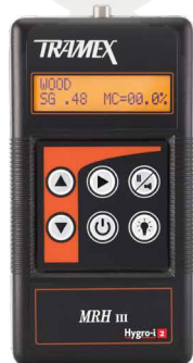
Product code: MRHIII MRH III