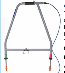
Part No: 10/RX-CD-STETHOSCOPE

This is utilized with a locator having CD to find and identify individual cables, using the CD signal from a Tx-10(B) transmitter. LEDs and direction arrows provide current direction. Other locators without CD can be used to detect and identify cables but without the current direction information.