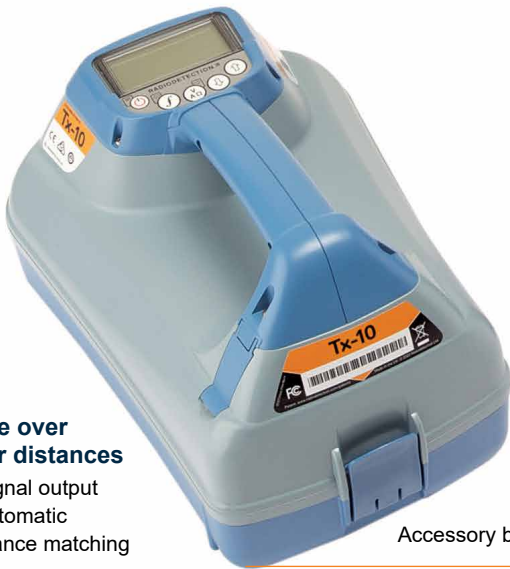
Accessory base tray

90V signal output and automatic impedance matching