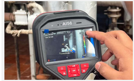
Gas Leakage Detection