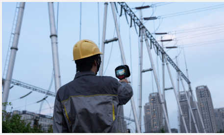
Partial Discharge Detection