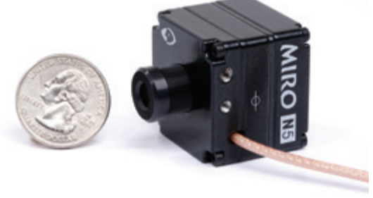
Miro N5 camera head connects to either Base model