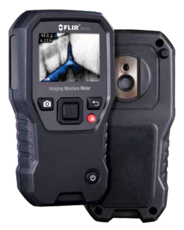
MR160 Imaging Moisture Meter