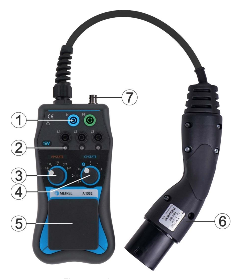
Figure 3.1: A 1532 components