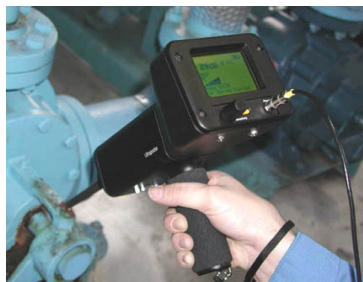
Baselines are usually set with a portable ultrasonic translator