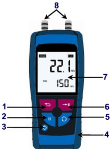
Fig. 1: Frontal view